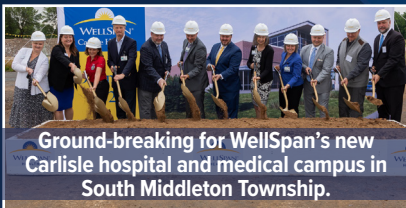
Ground-breaking for WellSpan's new Carlisle hospital and medical campus in South Middleton Township.