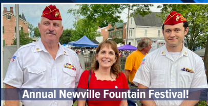
Annual Newville Fountain Festival!