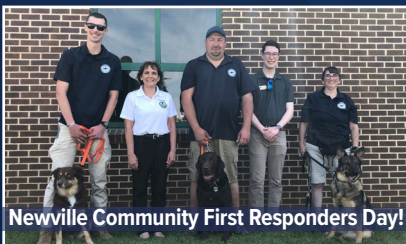
Newville Community First Responders Day!